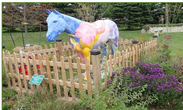
'Follow Your Dreams', donated by Orangeville Home Hardware and pollinator garden planted by students from CDDHS.