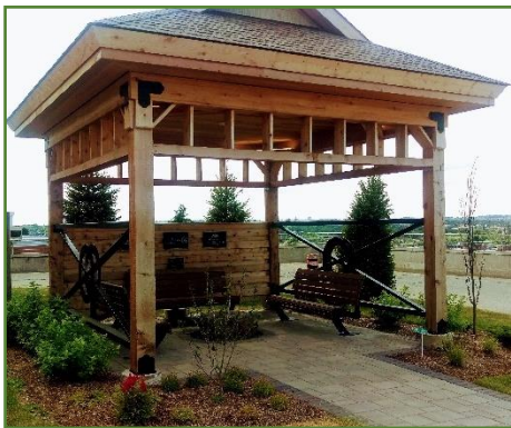
Rotary Orangeville, Devonleigh Homes and Whispering Pines worked together to build this beautiful pavilion with benches, 24-hour lighting and landscaping for those people using emergency and nearby departments.