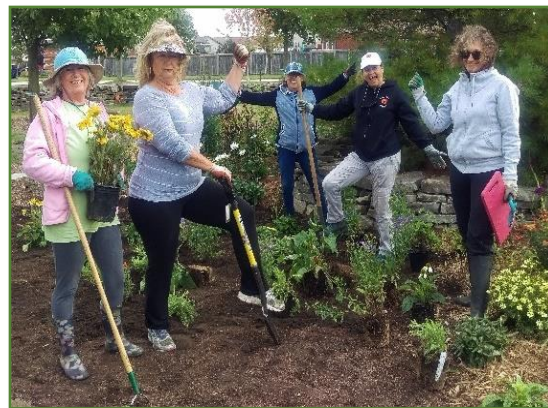
Volunteers planting pollinators.